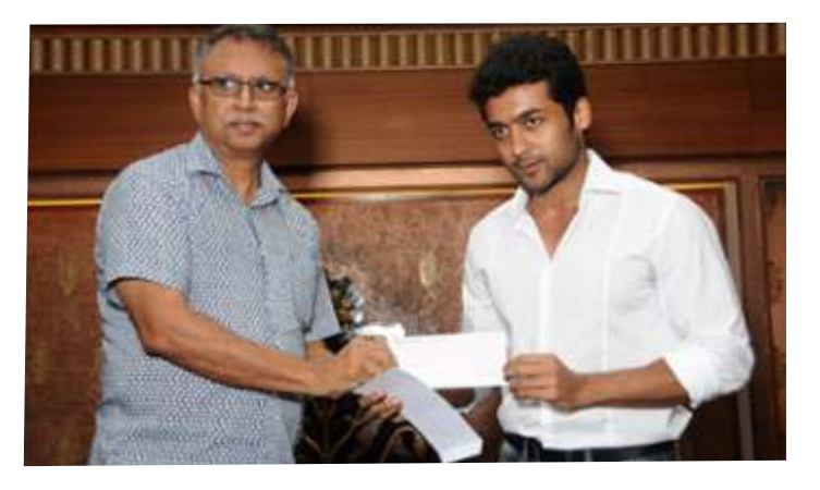
TANKER Foundation fundraising and Art Auction Programme was held at GRT Grand, Thiyagaraja Road, T. Nagar, Chennai on 11<sup>th</sup> August 2012 for supporting needy patient from Chronic kidney Disease.