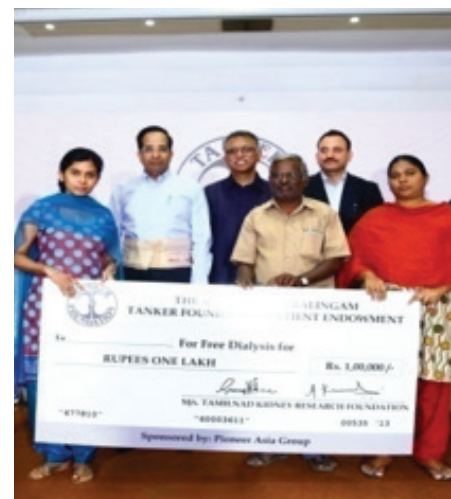
The Ashok Sankaralingam TANKER Foundation Patient Endowment - for 3 Patients

Canada. He and his team from Mumbai have been conducting epilepsy camps and training village workers to identify and refer them to the camps. The award carried a cash prize of Rs. 1,00,000/-, a citation and a gold medallion.