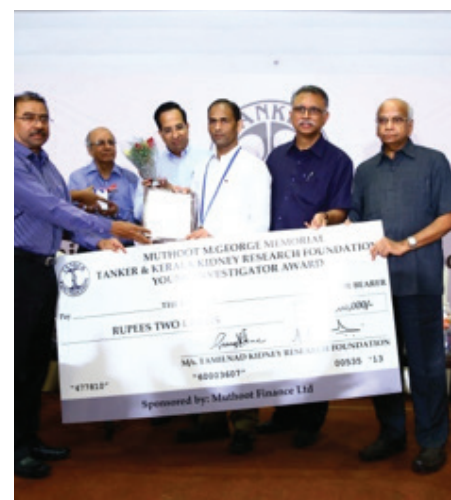
The Muthoot M. George Memorial & Kerala Kidney Research Foundation Young Investigator Award