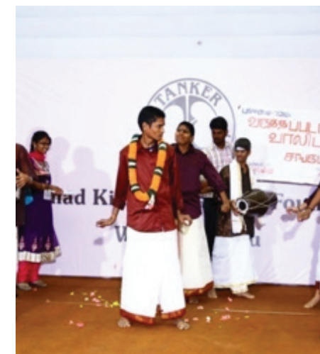
There were a Comedy skit and Dance programme by students of Sri Arunodayam Charitable Trust which empowers and enables disabled children.