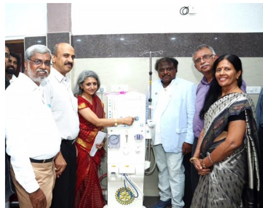
Rotary Club of Vellore Fort TANKER Dialysis unit Inauguration