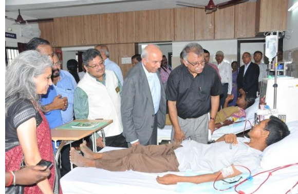
Rotary Club of Madras West TANKER Dialysis unit Inaugurated by Mr.Prem Watsa Fairfax Financial Holdings Ltd